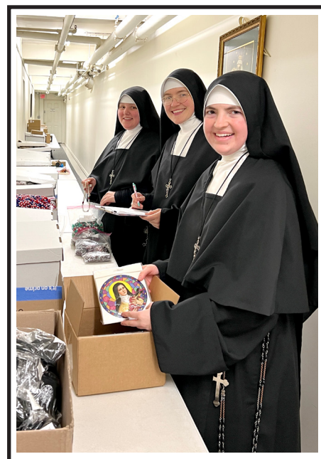
Preparations for this year's summer catechism program have begun. The Juniorate Sisters organized the prizes which will be awarded to the students attending our religion classes.