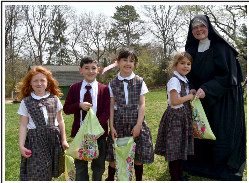
After assisting at the Holy Week ceremonies, the children at St. Pius V School enjoyed an Easter egg hunt on Holy Saturday.