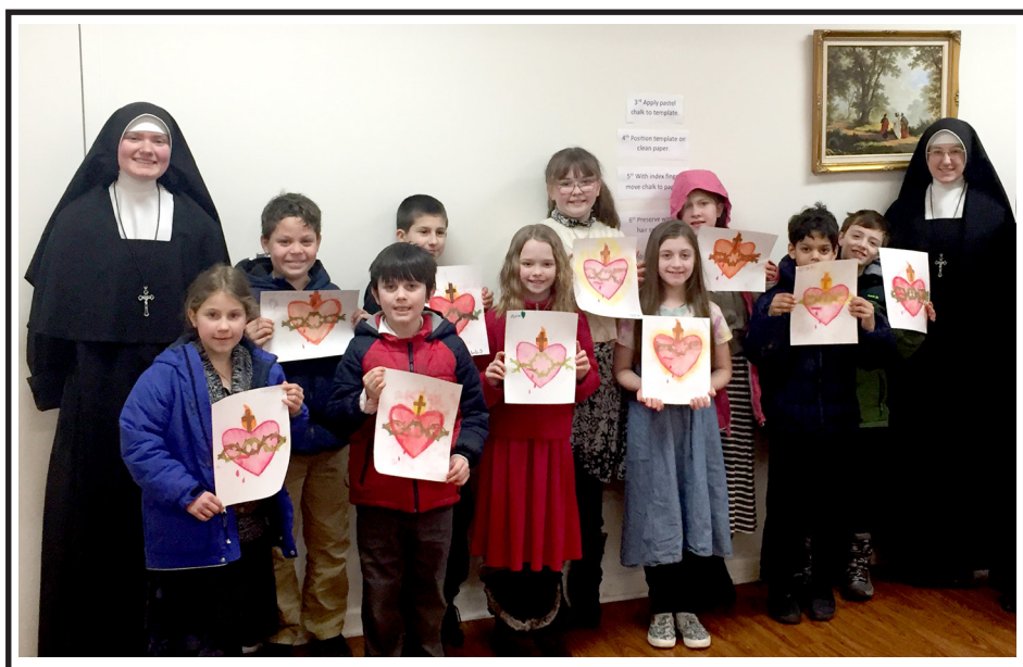
Left: During a students' Day of Recollection in Round Top, the children designed their own chalk art image to hang in their homes as a reminder of the love of the Sacred Heart.