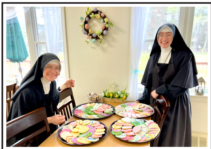
The Sisters decorate cookies as a special treat for Easter Week.