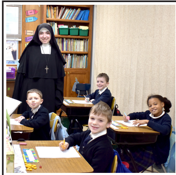
At St. Anne's Academy, Sister helps some of her first grade students.