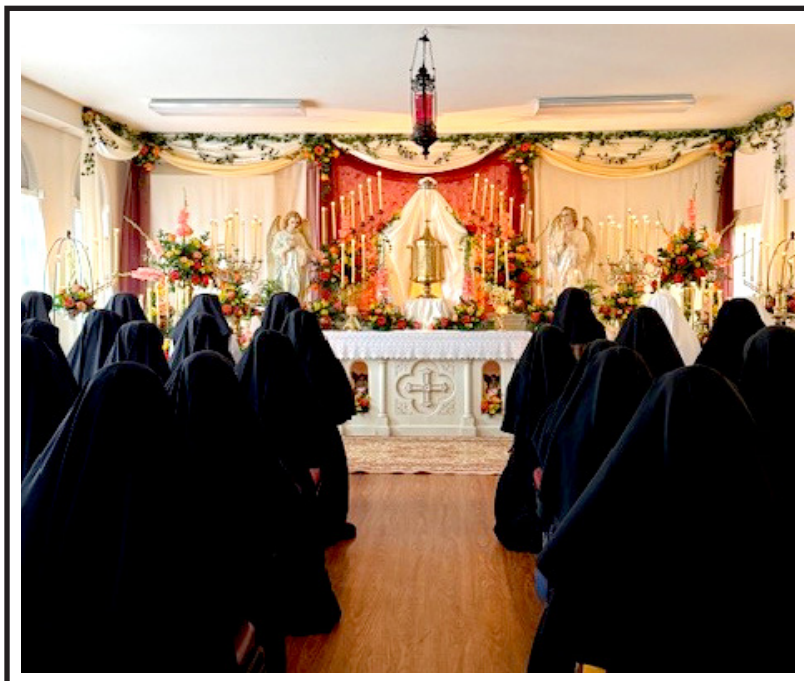
The Sisters spend time in prayer at the Altar of Repose from Holy Thursday to Good Friday.