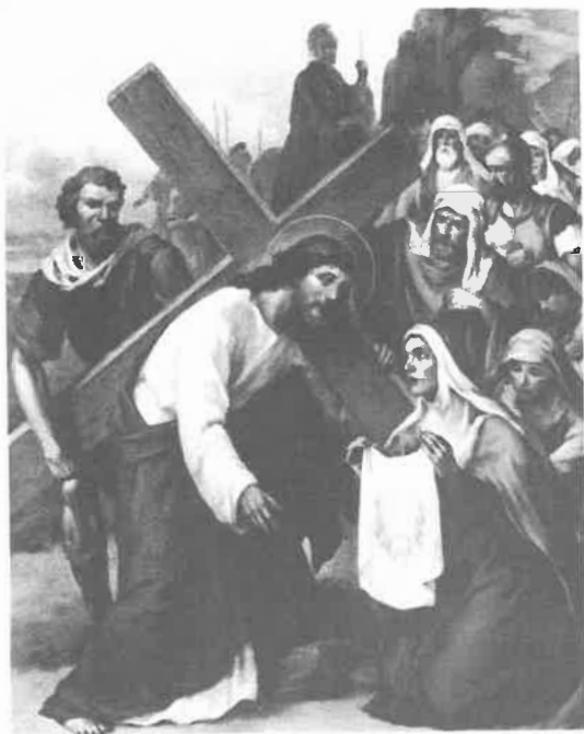
SIXTH STATION Veronica Wipes the Face of Jesus