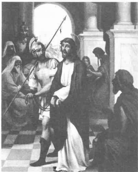
FIRST STATION Jesus Is Condemned to Death