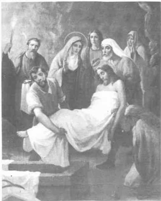
FOURTEENTH STATION Jesus Is Laid in the Tomb