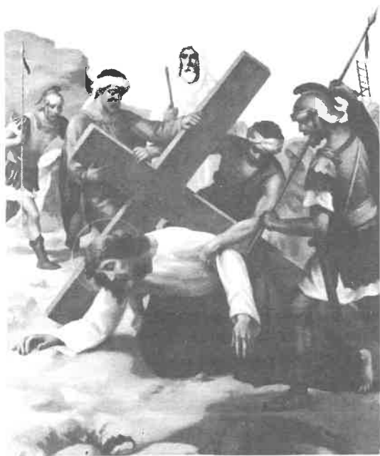
SEVENTH STATION Jesus Falls the Second Time