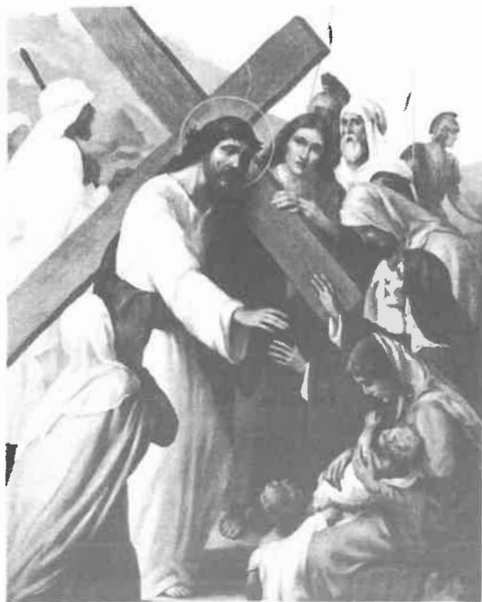
EIGHTH STATION Jesus Speaks to the Women of Jerusalem