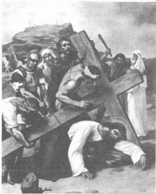
NINTH STATION Jesus Falls the Third Time