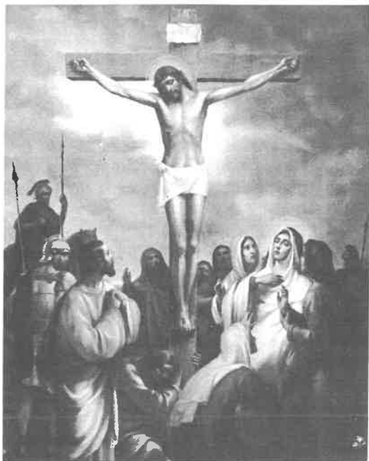
TWELFTH STATION Jesus Dies on the Cross