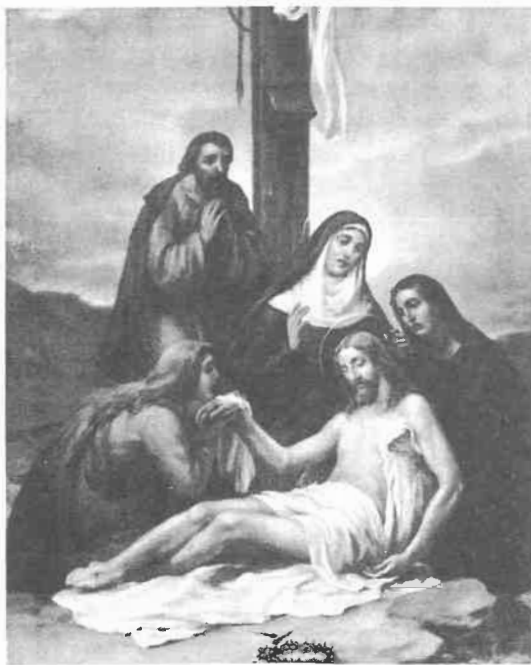
THIRTEENTH STATION Jesus Is Taken Down from the Cross