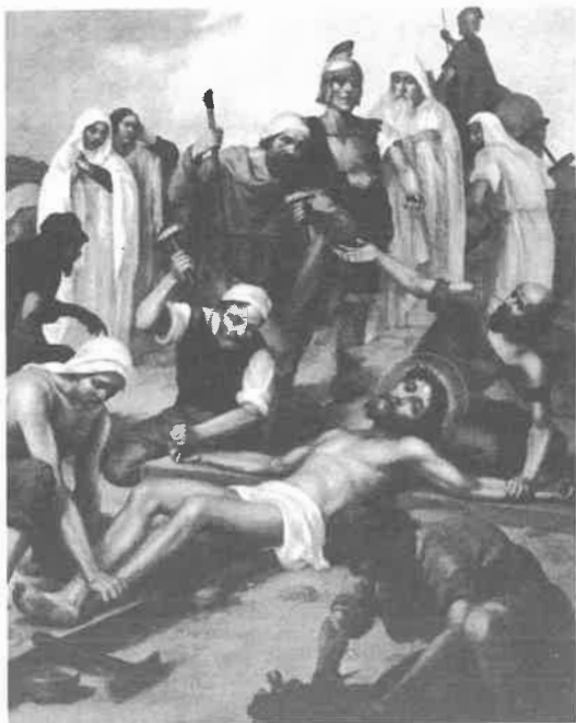
ELEVENTH STATION Jesus Is Nailed to the Cross