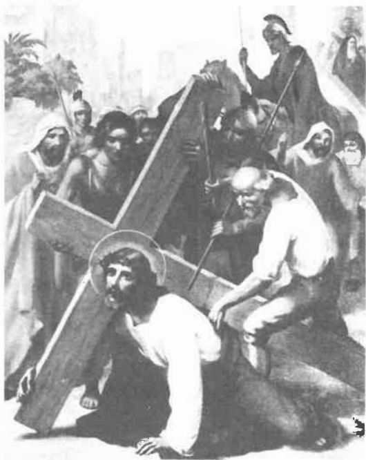
THIRD STATION Jesus Falls the First Time