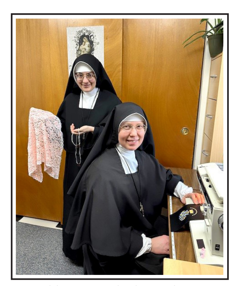
While one Sister embroiders missal covers, another sews chapel veils and brown scapulars.