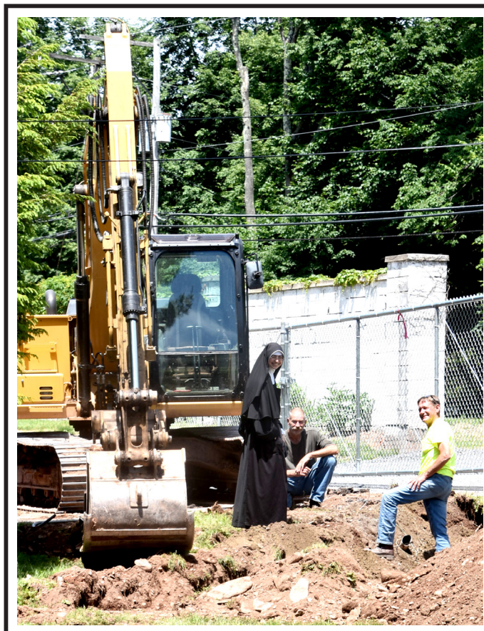
Earlier this year, an excavation company worked with us to widen the entrance that will be used as a construction access point.