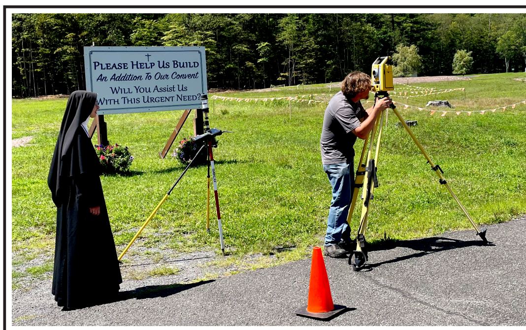
At the end of the summer, a surveyor took the final topographical measurements needed to complete our drainage and grading plans.