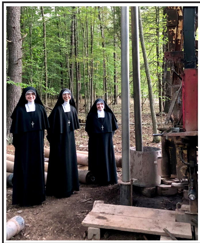
The Sisters visited the new well site during the final stage while the well driller performed a bail test.