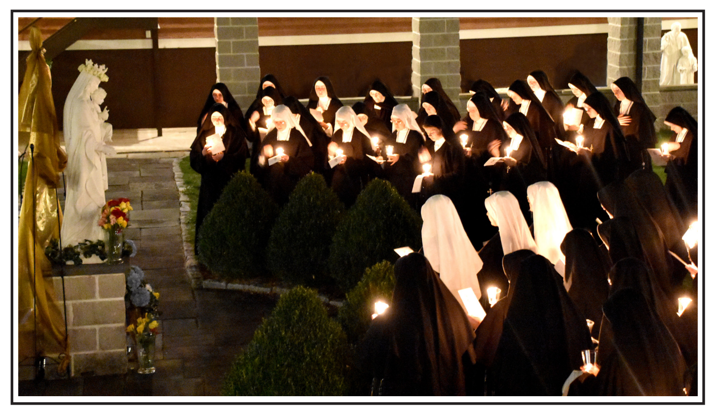
On October 11, the Feast of the Divine Maternity, we honored Our Lady as the Mother of Our Savior and patroness of our congregation with a candlelight procession at the Motherhouse.