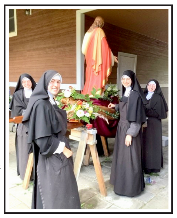
At St. Pius V School Melville, New York