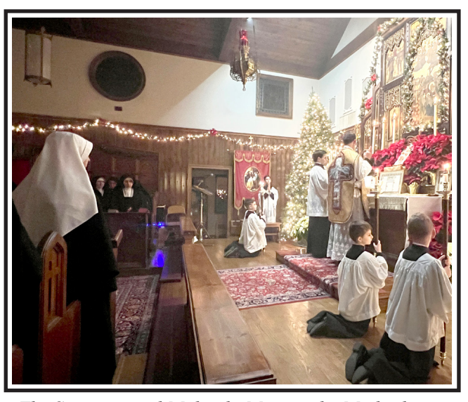
The Sisters attend Midnight Mass at the Motherhouse.