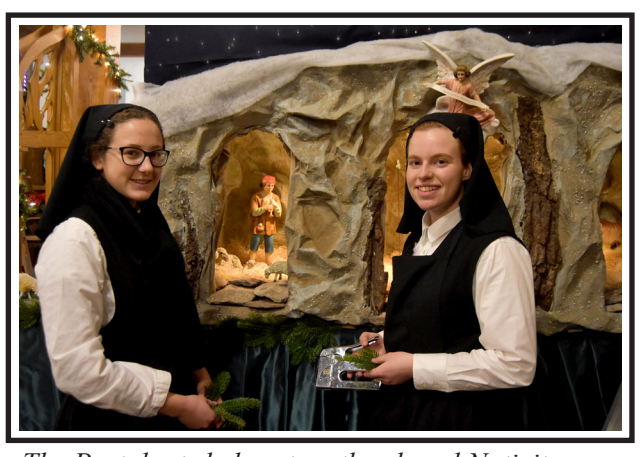
The Postulants help set up the chapel Nativity scene.

The Sisters also prepared for the holy season by carefully practicing the Gregorian Chant and carols which were to be sung on Christmas. For the week preceding the Nativity, we gathered in the chapel each day to sing one of the seven glorious and ancient "O Antiphons." These short selections of Gregorian Chant include various Biblical prophesies of the birth of Our Savior. It is a tradition in our convents to ring the altar bells throughout the entire singing of Our Lady's "Magnificat" which follows the antiphon each day.