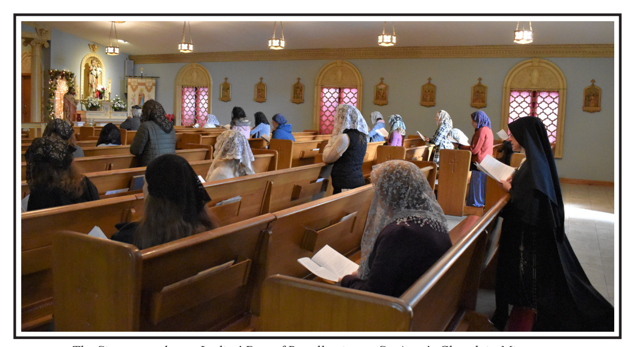
The Sisters conduct a Ladies' Day of Recollection at St. Anne's Church in Minnesota.